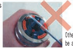
Other company's tools are needed to be adjusted with some tools.

The height can be adjusted just in a few second. Further more, you do not need any tools like an allen hexsocket wrench. It is possible to maintain tools safety, accurate, and speedy in just quarter time of standard 1-1/4" set assy.